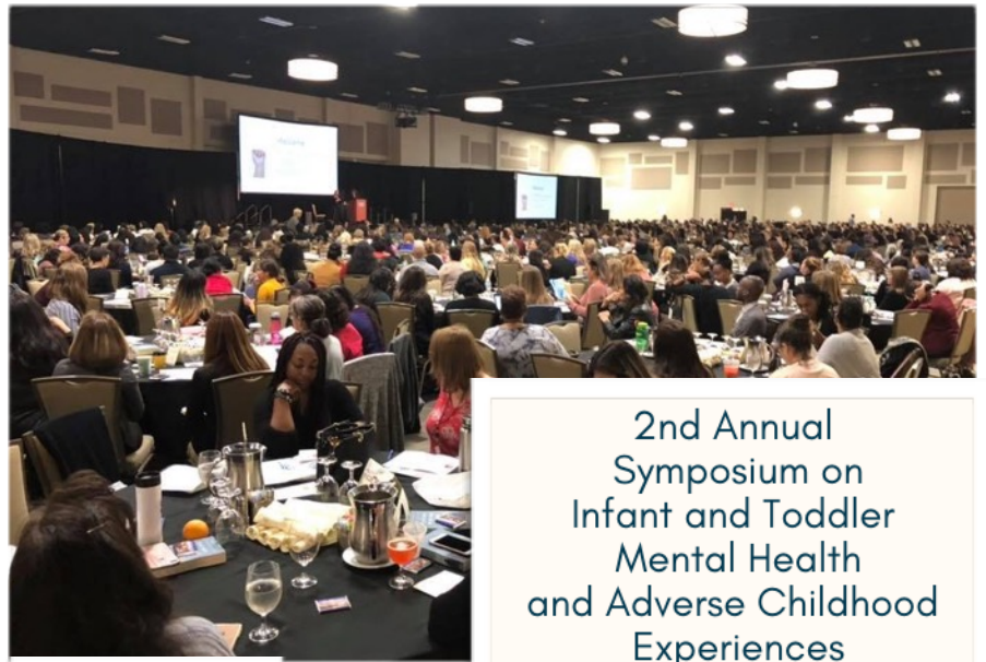
2nd Annual Symposium on Infant and Toddler Mental Health and Adverse Childhood Experiences