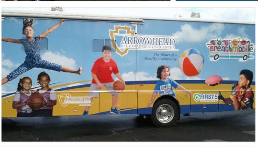
Description from Arrowhead Medical Center Website:

The Breathmobile® provides coordinated case identification, structured mobile office visits, diagnostic testing, physical exam, pharmacological therapy and patient/family education in asthma management. All services are provided at no cost to the patient. The Breathmobile® staff consists of a pediatric specialty practitioner, a licensed vocational nurse and a respiratory therapist who are specially trained in asthma case management. ARMC currently operates two Breathmobiles, one visiting schools in the Inland Valley and the other in the High Desert area of the county.