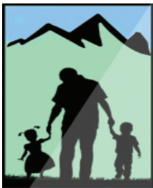
IEFIC INLAND EMPIRE FATHER INVOLVEMENT COALITION

Through its Developmental Care Coordination initiative, CCRC provided developmental screenings to 388 children and follow-up care coordination to 17 children.