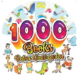
1,000 Books Before Kindergarten

43,596 Children | 330 Parents/Caregivers | 1,777 Providers