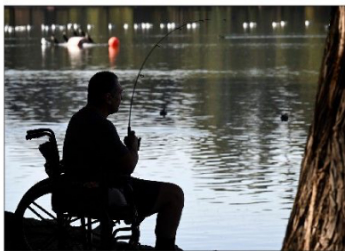
LEFT: A fisherman gets a bite or a snag at Seccombe Lake Park in San Bernardino on Monday.